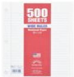
Pack of Standard Lined Paper