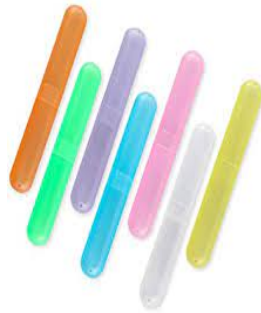
Small Soap Dish or like container to hold Crayons