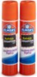
2 or more Glue Sticks