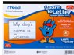
Primary Lined Paper