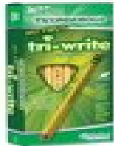
2 or more Ticonderoga- My First tri-write-Pencils