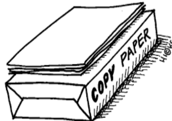
Pack of White Printer Paper