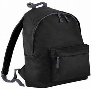
1- Standard Sized Kids Backpack