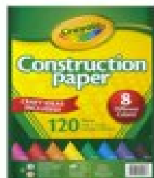
Pack Mixed Construction Paper