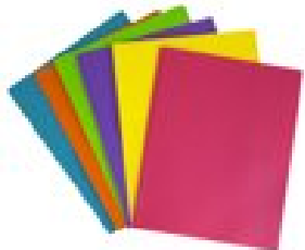
4- 2 Pocket Folders