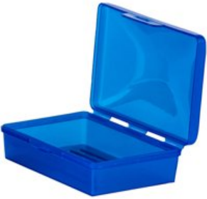
24 pack Crayola Crayon